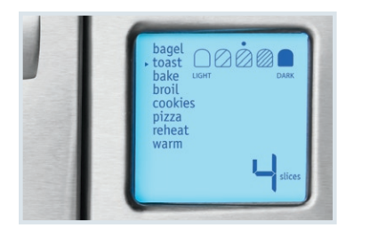
8 Preset Cooking Options Bake, Broil, Toast, Defrost and more at the touch of a button.