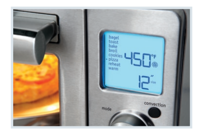
Pro-Select® LCD Display Large and easy-to-read display.