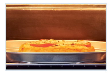
Rapid Cooking Infrared Technology Offers quicker preheating and cooking overall.